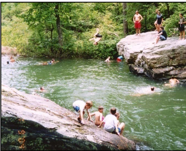
(How many kids can you count?)

Besides family vacations, possible uses for the cottages are: giving your pastor and his wife a few days together, marriage enrichment weekends, missionaries on furlough, deacon retreats, church leadership planning retreats, mother-daughter or father-son retreats . . . there are many possibilities. You could even split a week by spending Thu.-Sun. on a family vacation then giving your Pastor Mon.-Wed.